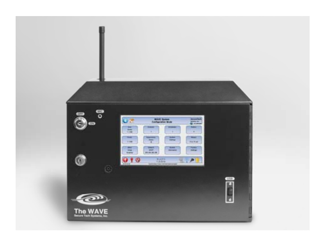
WAVE Plus Control Panel Communicates with Output Devices